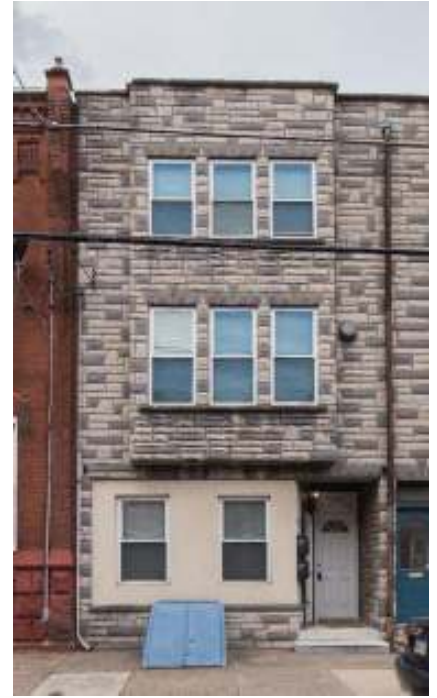
Store in 2018